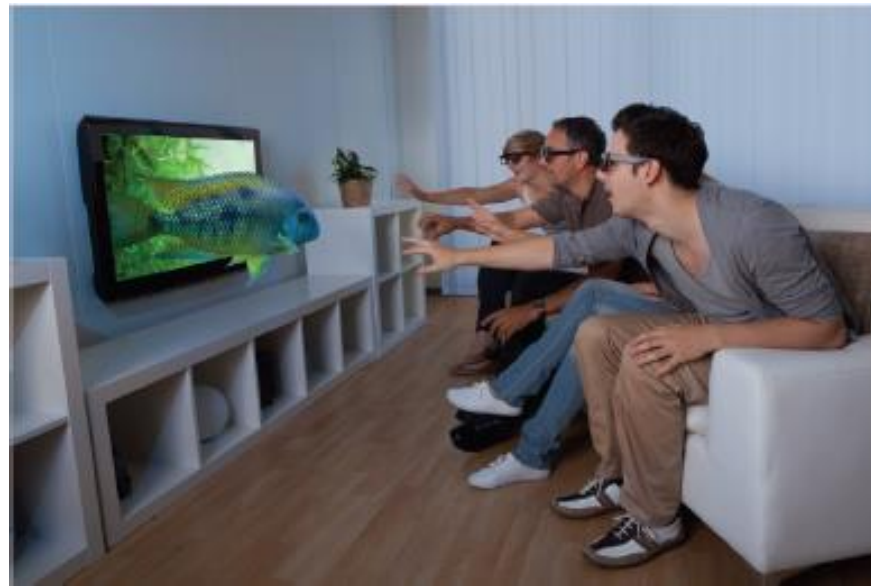
Figure 2.2 A family watching 3D TV