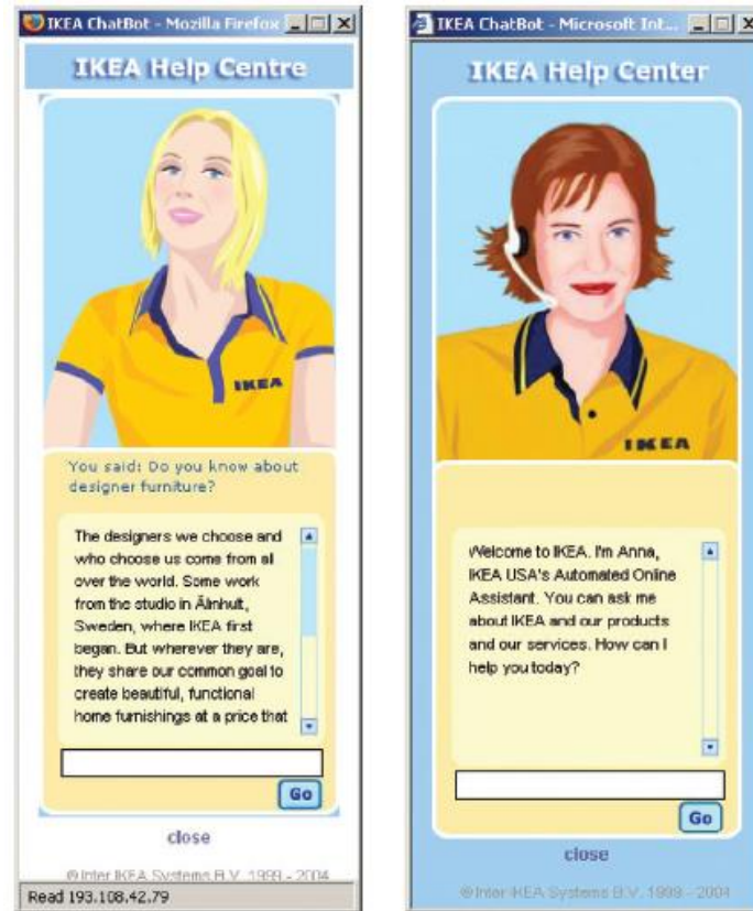
Figure 1.7 Anna the online sales agent, designed to be subtly different for UK and US customers. What are the differences and which is which? What should Anna's appearance be like for other countries, like India, South Africa, or China?